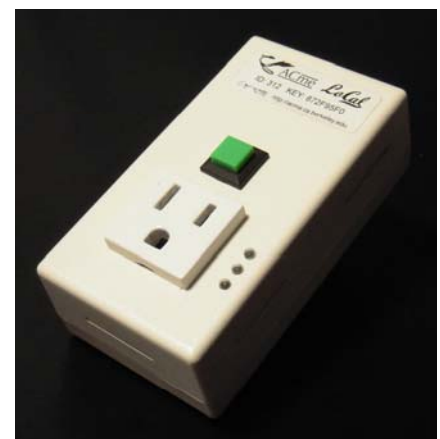
An ACme wireless power meter, developed and implemented as part of the LoCal project.